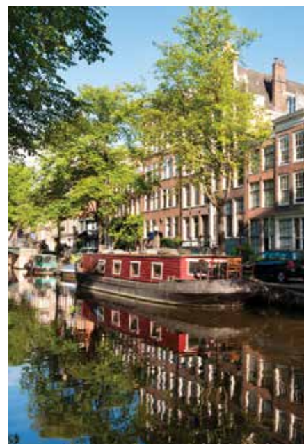
Perhaps explore Amsterdam's picturesque canals on a glass-top boat