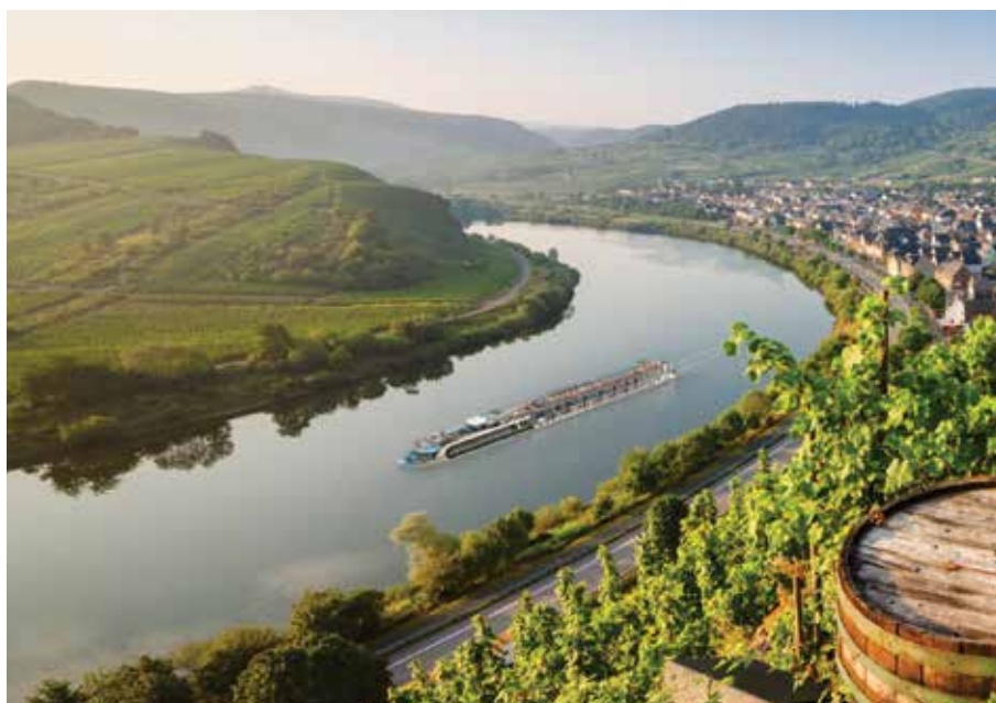
On soothing waters, let the wonders of Europe come to you

Arrive back in New Zealand where your tour ends.