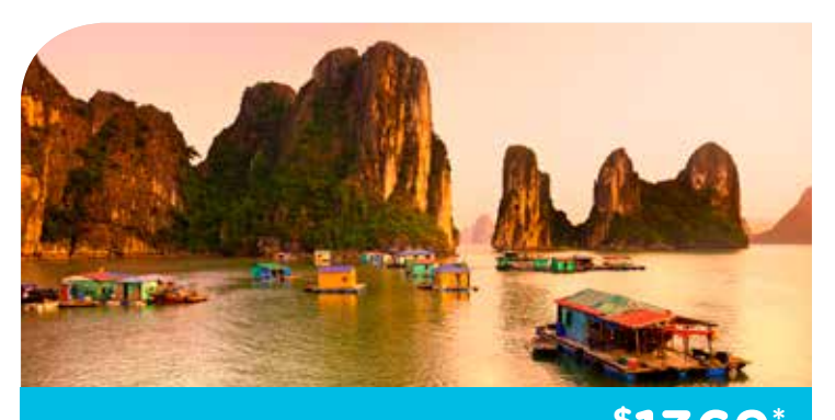
5 NIGHTS FROM $1369*

TWIN SHARE IN AN INSIDE STATEROOM, CAT IS