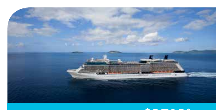
7 NIGHTS FROM $2319* TWIN SHARE IN AN OCEANVIEW STATEROOM, CAT 8