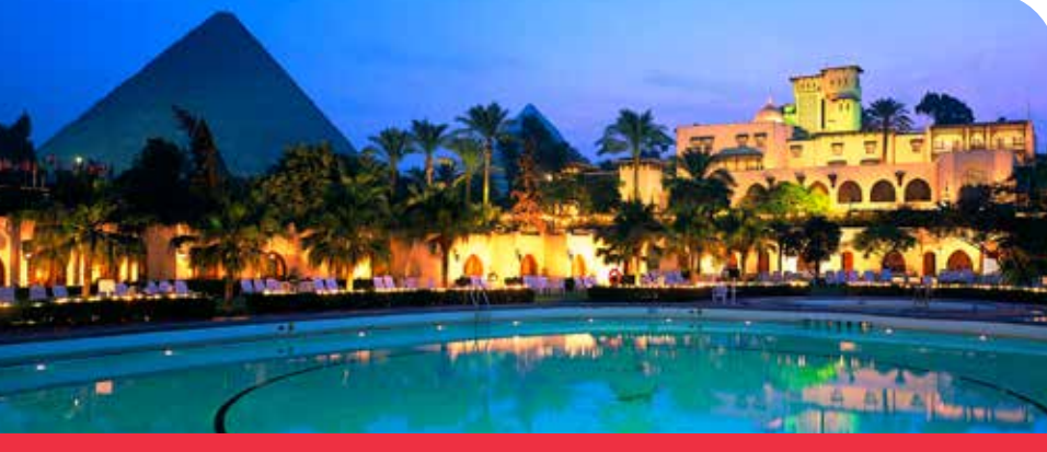
BONUS: Save $300*pp when you pay by 14 Oct 2016